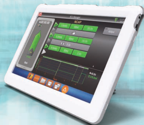
Salient pictured with the wireless Remote Control Unit (DC009DW only)